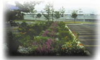
Low-Impact Development for Commercial Property, Prince George's County, MD