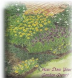
Public Participation Through Homeowner BMP Maintenance