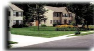
Runoff Retention Using On-lot Bioretention; Runoff Detention Using Modified Open Drainage Swale